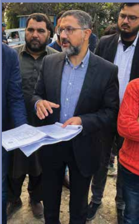
Tree Plantation Drive Barki Campus

Prior to that, several football and cricket fixtures, musical event, first Alumni Homecoming have been organized at the Main Campus. The fourth convocation of ITU held in December 2023 was also successfully hosted at the same venue.